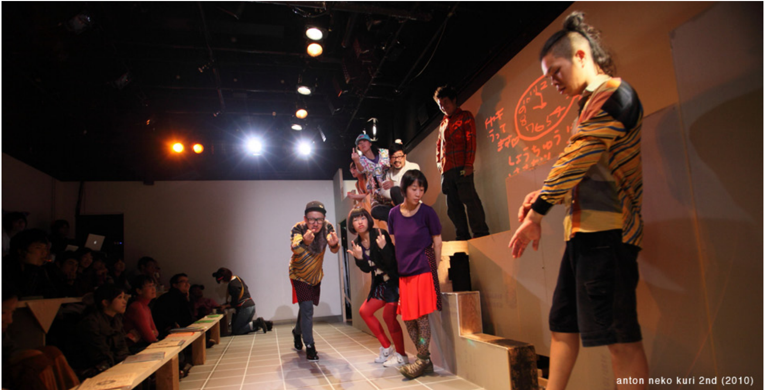
anton neko kuri 2nd (2010)

residency at the Kyoto Art Center in FY14; participation in T-PAM sessions; seeing a wide range of performances; and a meeting with Faifai, to plan for their U.S. tour.